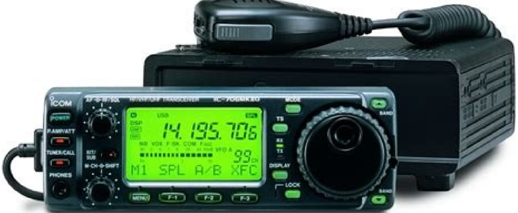
Ic 706 mk2 service manual. Icom ic-706 service manual pdf. Icom ic-706 mk2 service manual. Icom ic 706mk2g service manual.